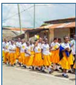
(l) Mafia Island construction. (r) Pilgrims from Dar es Salaam

the people in this area. Through this project, we plan to help over 1,000 children annually who are on pilgrimages from Dar es Salaam, local families gathering for prayer and community, and mission groups and volunteers entering the area for both long- and short-term projects and ministries. For more information and to support the project, go to salvatorians.com/sacredshoresproject-mafiaisland-tanzania/