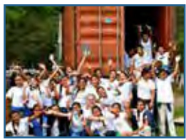
Shipped container arrives!