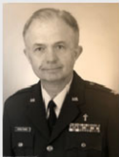
Chaplain in the Service

from leadership in Rome, for the witness of his life, 'marked by humility and joy' and a wonderful spirit of generosity.